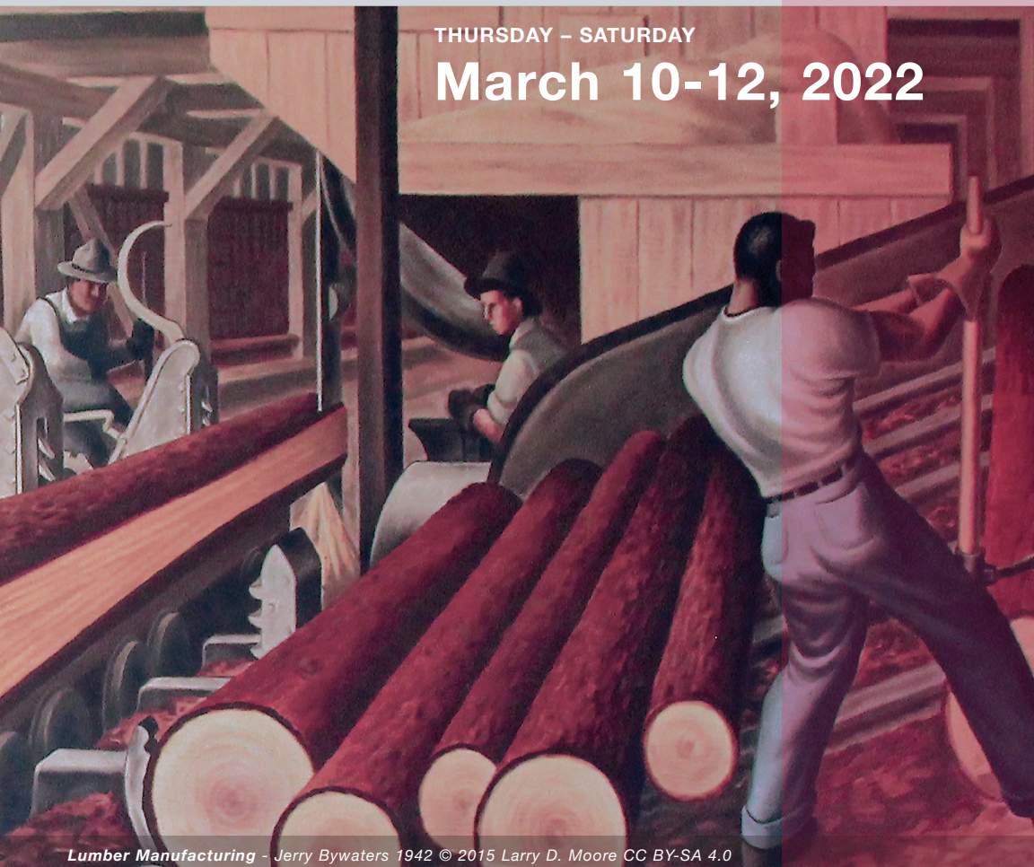
Lumber Manufacturing - Jerry Bywaters 1942