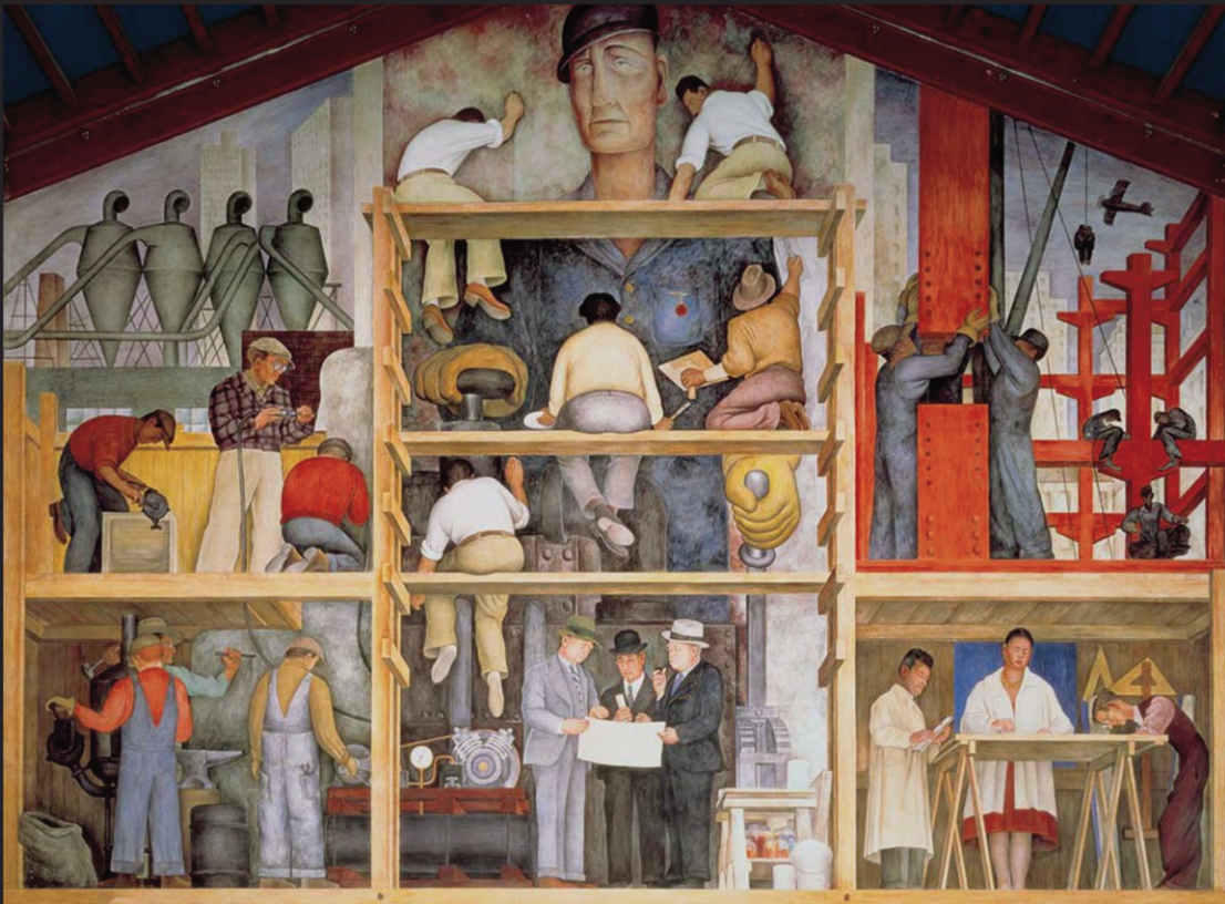
The Making of a Fresco Showing the Building of a City by Diego Rivera 1931 © 2012 Joaquin Martinez