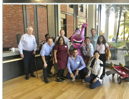
Top to bottom: